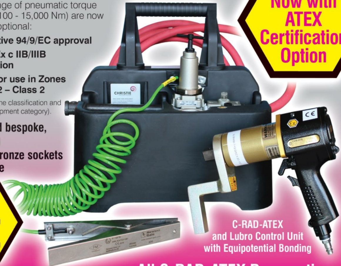
C-RAD-ATEX and Lubro Control Unit with Equipotential Bonding

C-RAD Now with ATEX Certification Option